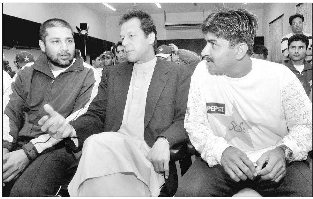
MEETING OF THE MINDS: Pakistan cricket legend Imran Khan (C) explains something to current captain Inzamamul Haq (L) while coach Javed Miandad listens during a visit to Gaddafi Stadium in Lahore yesterday.