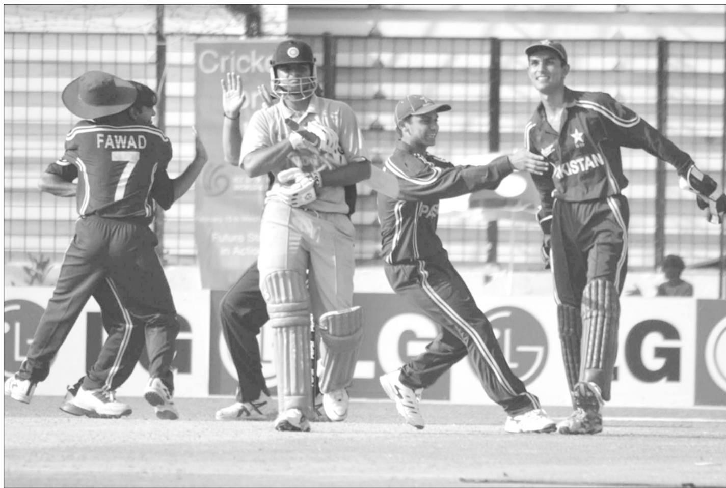
Pakistan U-19 players celebrate the dismissal of Suresh Raina of India during their ICC Under-19 Cricket World Cup semifinal at the Bangabandhu National Stadium yesterday.

Western Union Premier Football League Mohammed vs Badda Jagarani (3:00 pm) Abahani vs Dhanmondi (5:00 pm) Venue: Sher-e-Bangla National Stadium, Mirpur ICC U-19 Cricket World Cup Plate Championship Second Semifinal Bangladesh vs Scotland (9:00 am)