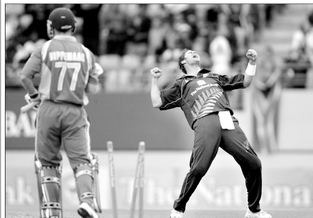
New Zealand all-rounder Chris Cairns (R) celebrates clean bowling South Africa's Boeta Dippenaar in the fifth one-day international at Eden Park in Auckland yesterday.