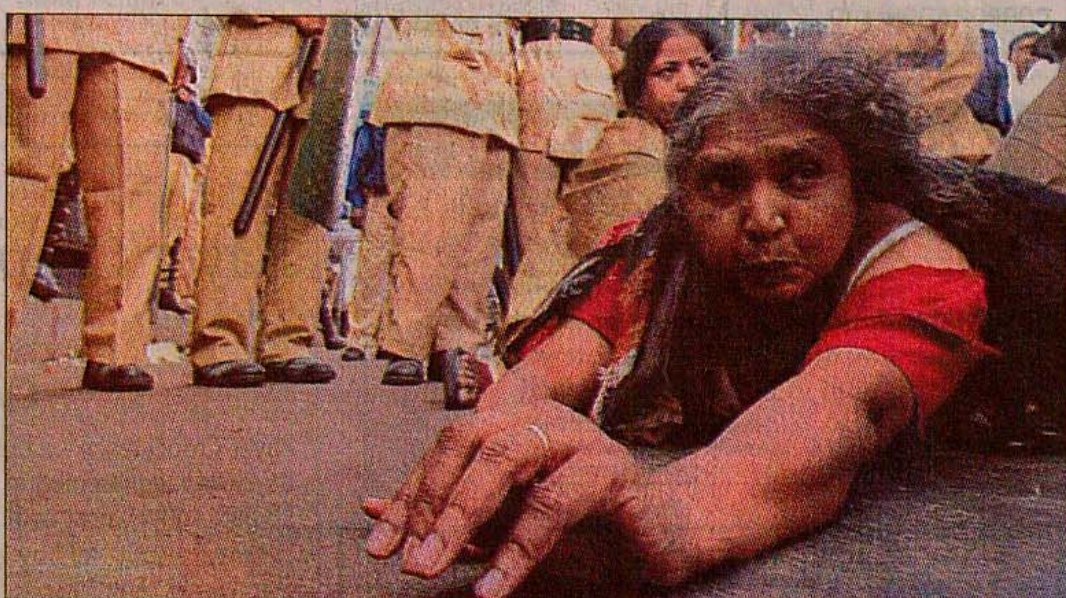
Awami League leader Motia Chowdhury falls to the ground during yesterday's hartal on Bangabandhu Avenue as cops tried to shove her into a prison van. Her dress torn, she lay on the street for 10 hours until the hartal ended at 6:00pm.