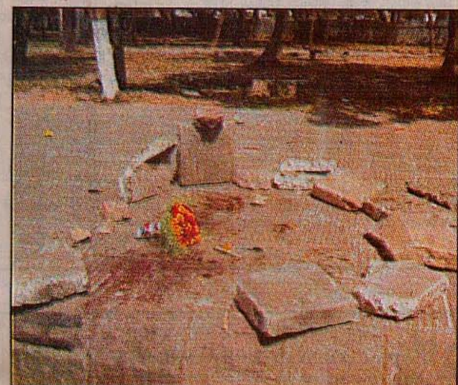
Students ring the blood-smeared spot, left, yesterday where unknown assailants stabbed prominent writer Humayun Azad a day ago; Leader of the Opposition Sheikh Hasina, right, walks toward the Combined Military Hospital along with her Awami League colleagues to see the Dhaka University teacher after her car was barred from entering the cantonment.