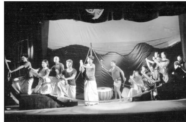
A scene from the play Shampan Naiya