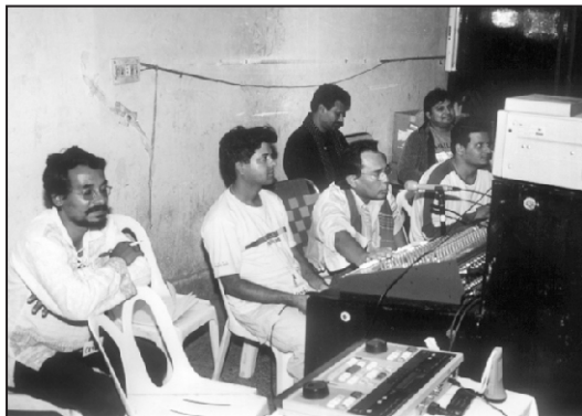
Director Humayun Faridi in action while actress Subarna Mustafa is seen hosting one of the episodes of the quiz show Medhabi

popular around the world and no one can deny the importance of these as a medium of nurturing knowledge, especially for the youth. But in Bangladesh there have been no well-made programmes in this sector.