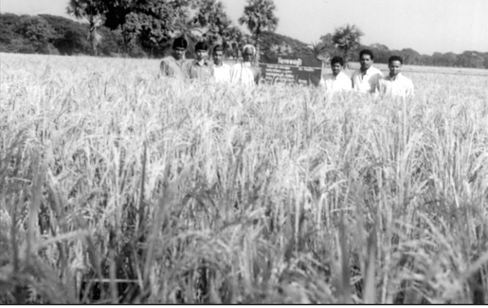
(File photo) HYV seed paddy ready for harvest at Dhidpur village. The photo was taken last year.

The farmers said their preservation method is very simple. They select the best quality paddy to preserve those as seed. After harvest they dry those in sunshine for four days and keep those in specially made air-tight containers made of clay or some other material, using preservatives which are also