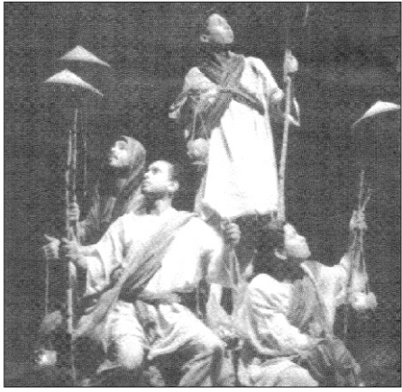
A scene from the play Tirthonkar