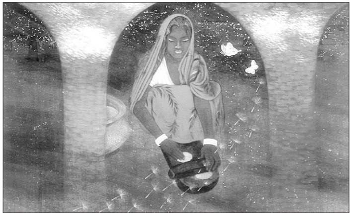
Samarea Woman (Stone powder, colour powder, paper)

The exhibition is open till February 28 from 11 am to 7 pm daily except on Fridays which is from 3 pm to 7 pm.