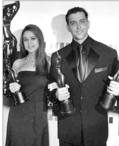
Preity Zinta and Hrithik Roshan, beaming in glory with the Manikchand Filmfare Awards

Kal Ho Na Ho walked away with eight awards, including those for the best actress and best supporting actor, at the 49th Filmfare awards held in Mumbai on Saturday.