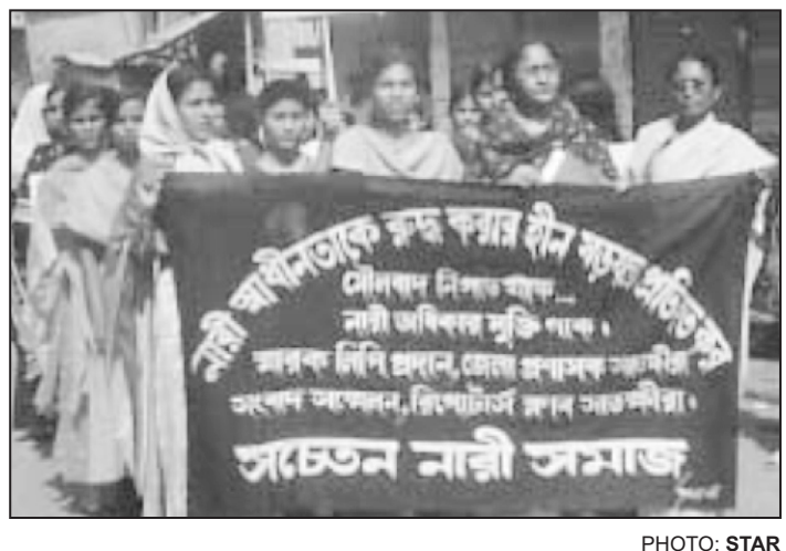
Female students brought out a procession in Satkhira town on Thursday protesting cancellation of women's volleyball competitions in Assussuni and Kaligang