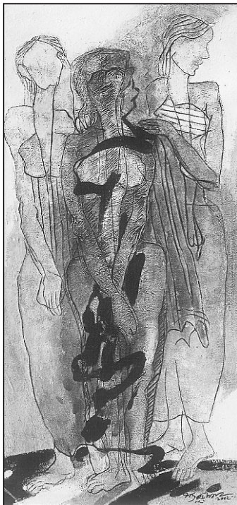
Virgin in black lines - Acrylic