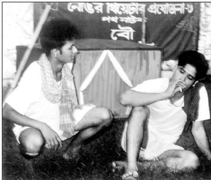
One of the many productions held at Rabindra Sarovar Unmukta Mancha