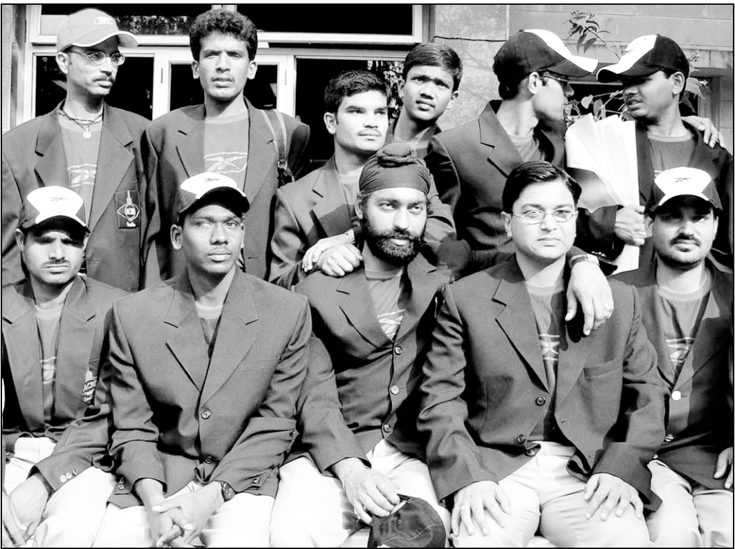
Indian blind cricket team members pose for photographers before entering Pakistan through Wagah Border Post yesterday.