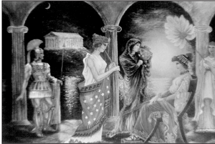
Illustrating the ancient Roman way of life

In the painting of Zanzibar was an island in the ocean in which we see the trees against a background of the water in blue and orange. The