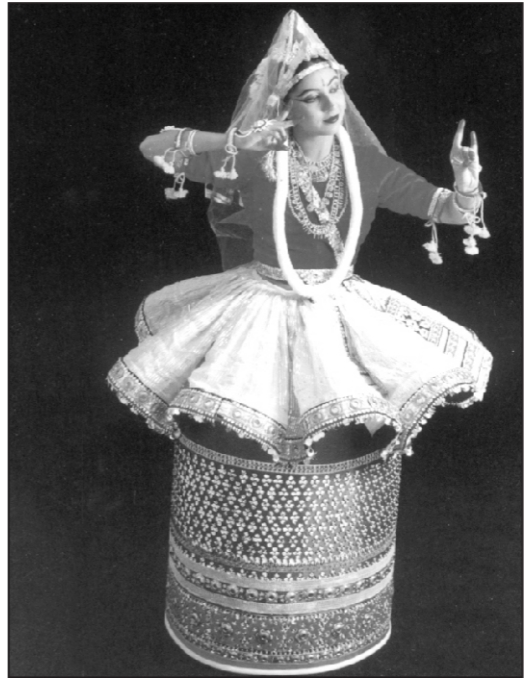
Rapt in a Manipuri posture

Just recently, I choreographed the children's theatre-dance production Toray Badha Ghorar Deem, adapted from Satyajit Ray's 'Limerick'. It was basically a 'Tuna-Tuni' production and was very much appreciated by the audience at Kolkata as well.