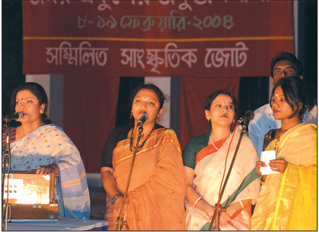
Artistes of Padatik Natya Sangsad render songs on the Central Shaheed Minar premises yesterday. Sammlita Sangskritik Jote organised the function on the occasion of Amar Ekushey.