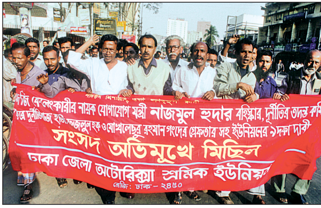
Dhaka Zila Autorickshaw Sramik Union took out a procession in the city yesterday to press for its 9-point demand, including resignation of Communications Minister Nazmul Huda.