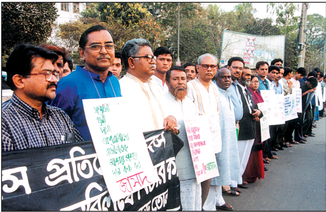
Jatiya Samajtantrik Dal (JSD) forms a human chain at Muktangon in the city yesterday in observance of the death anniversary of its leader Kazi Aref Ahmed.