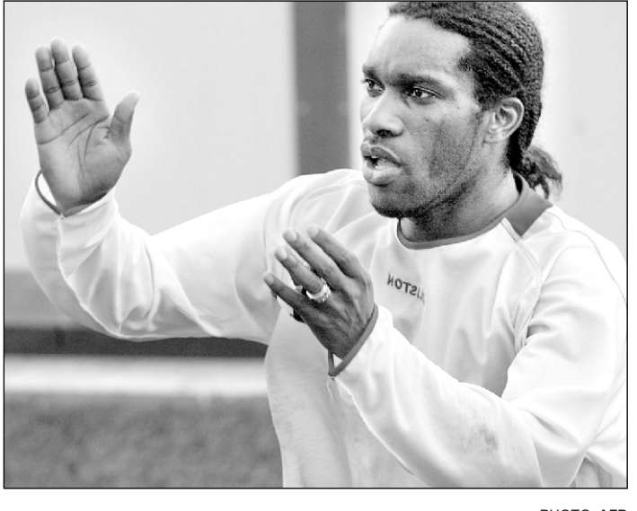
Nigerian superstar Jay-Jay Okocha leaves the field after helping his side secure third place in Monastir on February 13.