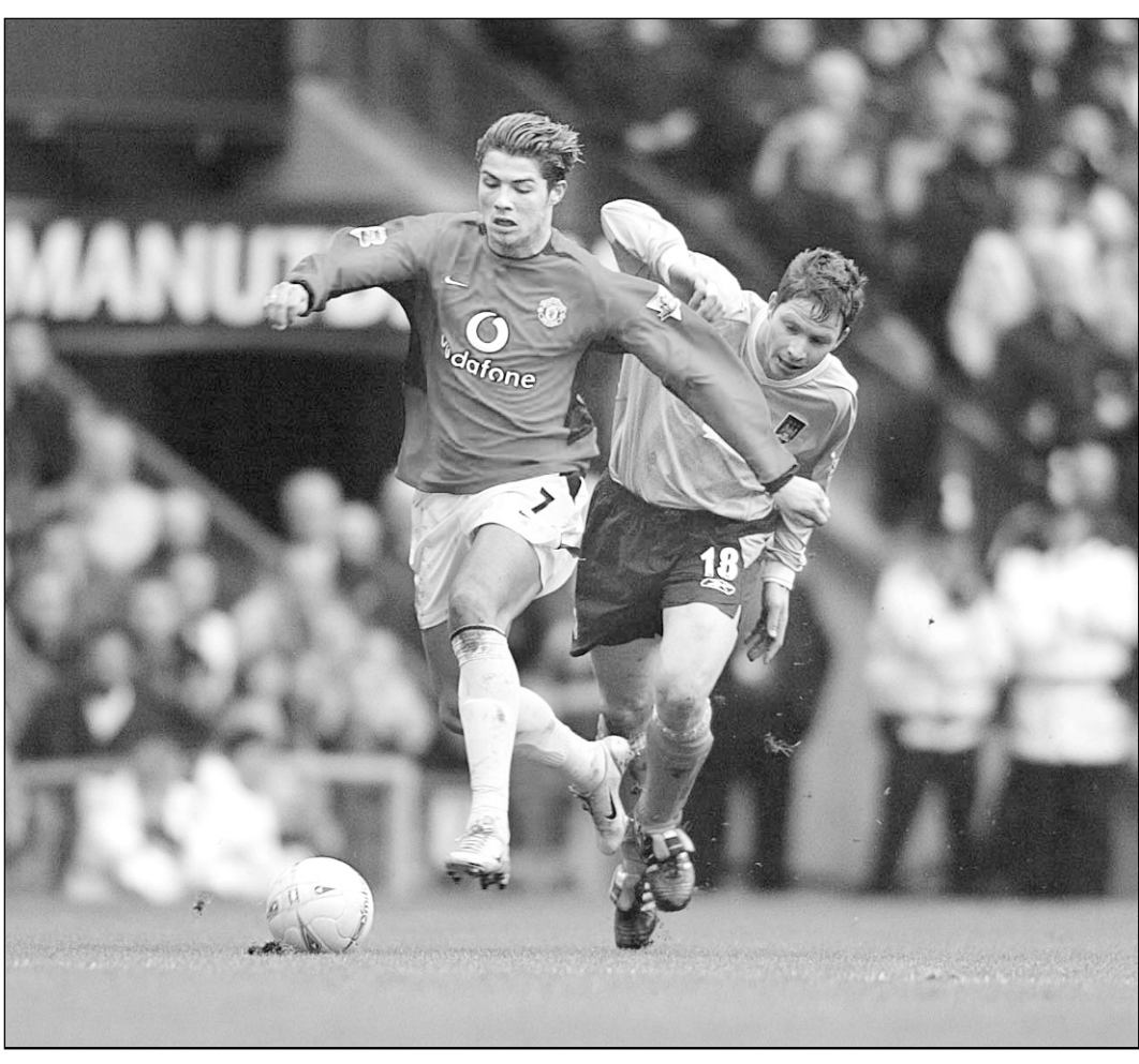
Manchester United's Portuguese international Cristiano Ronaldo (L) gets the better of Manchester City's German defender Michael Tarnat at Manchester yesterday.

AFP, Paris Russian qualifier Dinara Safina, the sister of recent Australian Open runner-up Marat Safin, reached the semifinals of the WTA Paris Indoor Open with a 6-2, 4-6, 6-4 victory over Francesca Schiavone on Friday. Safina, world-ranked 40, beat the Italian after two hours on court and looked to have had the match wrapped up quickly after leading 2-0 in the second set having won the first.