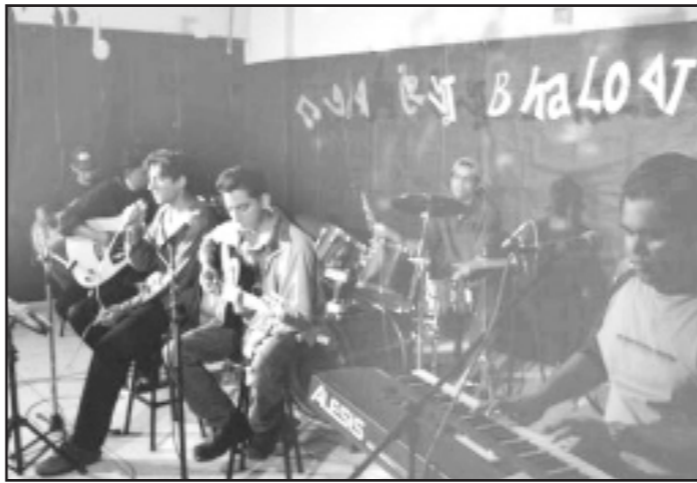
Triloy performing at the NSU concert

continuing line up. Their tuneful compositions in fact made the very enthusiastic NSU audience perform their rolling dance, with hands in swirling motions. One of the tracks featured the guest appearance by Elita on vocals and Sanjana on the violin. They worked really well together: some great tunes and melodies and the violin added that little bit of a twist and the crowd -- squeezed in by then to over capacity -- loved it too.