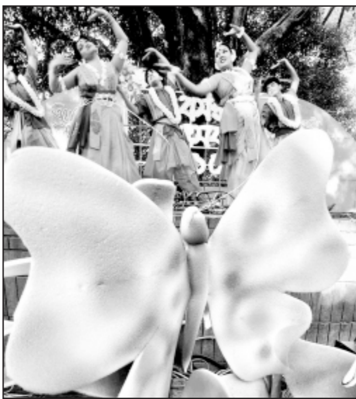
Bangladeshi dancers perform traditional dance during a ceremony to observe Basanta Utsab (Spring Festival) in Dhaka yesterday. The cultural ceremony welcomed the first day of Basanta/Spring Season, known as the symbol of life and begins with the first day of Bengali month Phalgun.