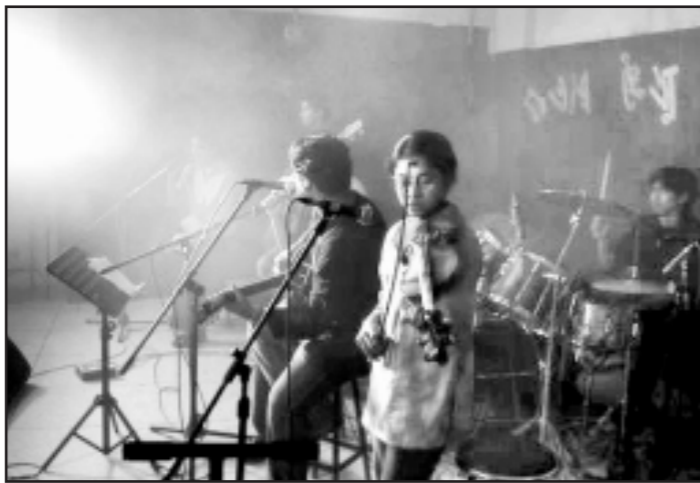
Band Artei rendering a popular track at the concert

As these club actions continue to take place, apart from the fact of 'extra curricular activities', these musical events are actually providing a greater sense of satisfaction which is perceptible clearly from the students' response on that winter evening.