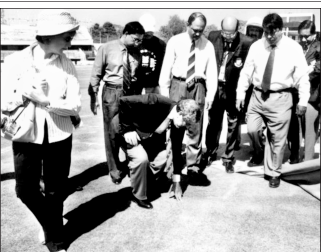
ICC president Ehsan Mani inspects the pitch at the MA Aziz Stadium yesterday.