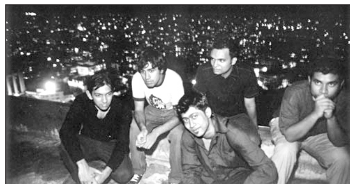
Black trying to make a breakthrough in their latest venture

'Off Beat' will be telecast on Channel i at 7:50 pm on February 14.