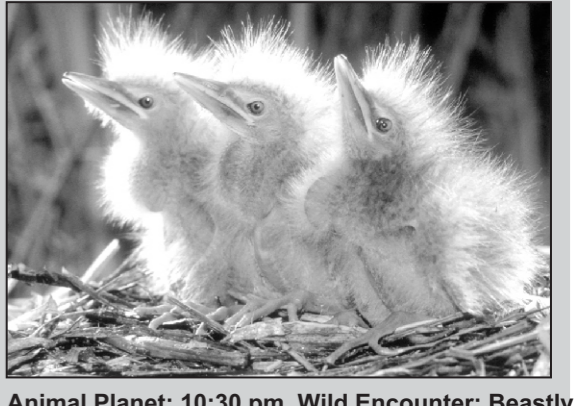
Animal Planet: 10:30 pm. Wild Encounter: Beasty B...

(Aka Dangerous) STAR SPORTS 9:30 English Premier League Highlights (R) 12:30 English Premier Football League 2003/04 Chelsea Vs Charlton Athletic (R) 4:00 Gillette World Sport 2004 (R) 4:30 Best Of Harsha Online (R) 5:00 Entertainment Endzone - Kick Off Soccer(T) 6:30 Hitz (R) 7:00 Entertainment Sports Mania (T) 8:00 Sportsline (L) 8:30 Futbol Mundial (T) 9:00 Classic's Big Fights Boxing Hour 10:00 SamsungSuperskills Group A - Powerpull &