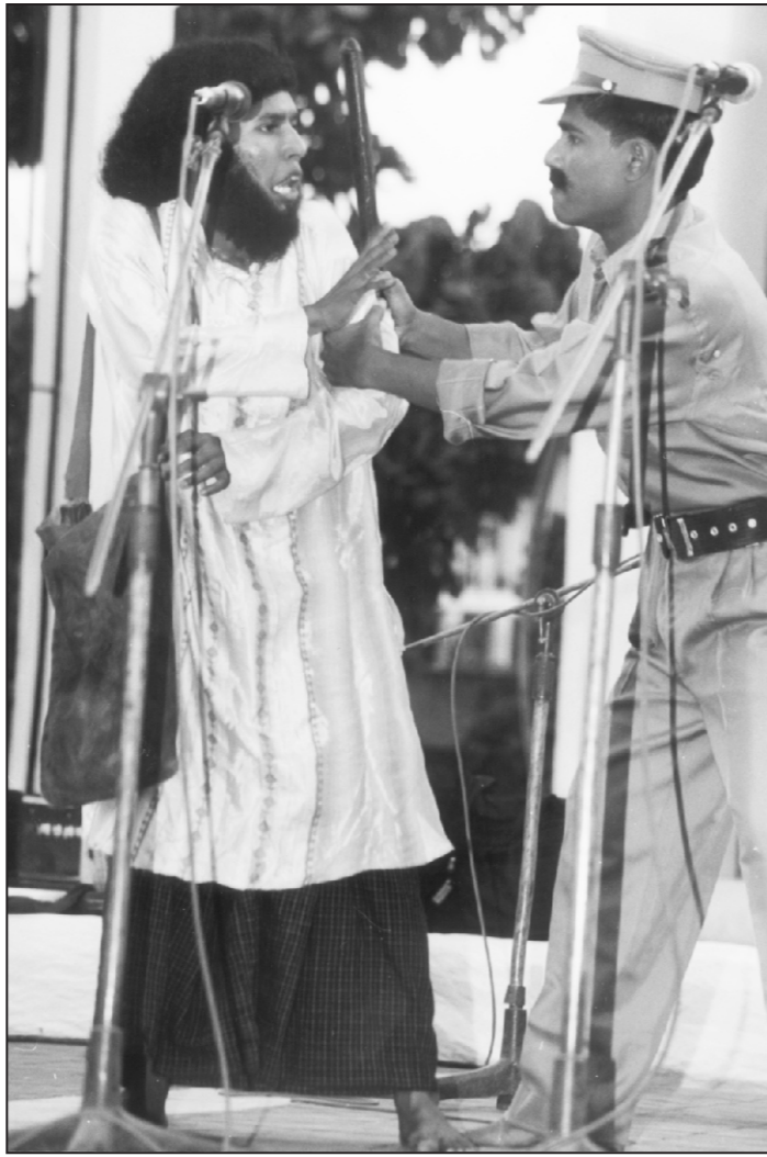
Nattaykunja presents a play 'Shadinata Amar Shadinata' at the Central Shaheed Minar