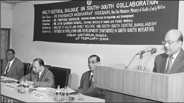
Health Minister Khandaker Mosharraf Hossain speaks at the Multi-sectoral Dialogue on South-South Collaboration at Cirdap auditorium on Saturday.