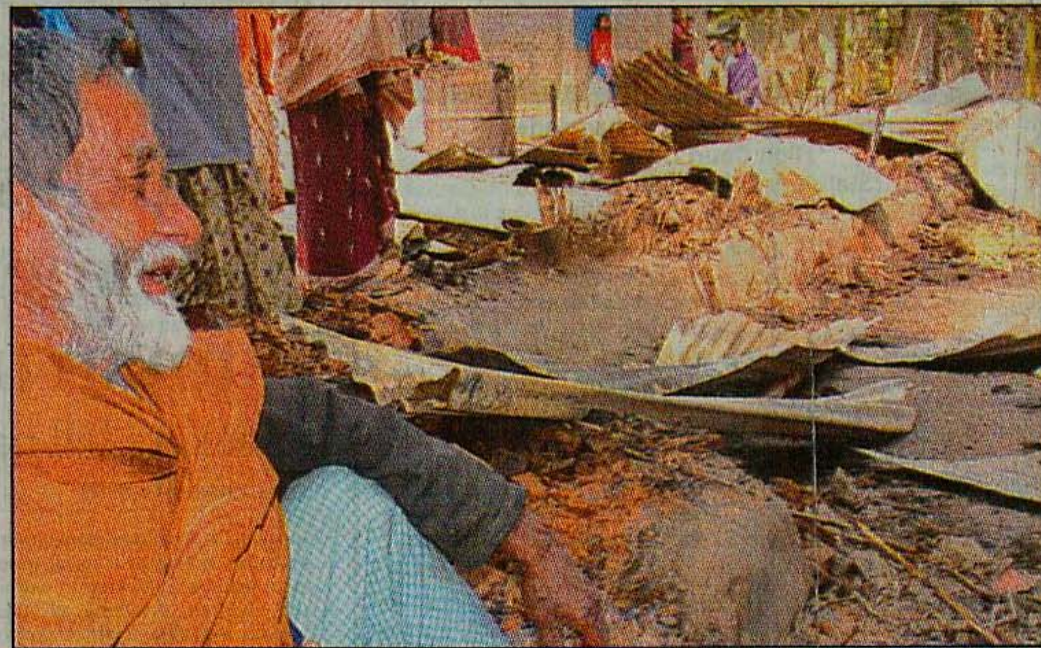
An elderly villager of Shahpara in Natore cries as he lost his house in a revenge arson attack carried out allegedly by BNP activists in the wake of the killing of the nephew of a deputy minister in the northwest district on Saturday.