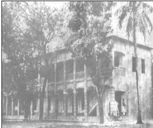
The original academic building of St. Joseph School at Narinda

The frolics continued even on the next day, when the newly renovated basketball court was declared open. To celebrate this moment, a match was organised between the present school basketball team and the St. Joseph's Old Boys Association. After lunch, a special moment, titled 'Reminiscence' was organised, where former students and headmasters voiced their love for the school and school-time stories, followed by a cultural