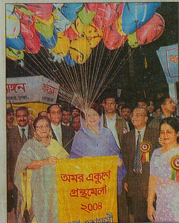
Prime Minister Khaleda Zia opens the Ekushey book fair on the Bangla Academy premises amidst demonstrations by BCL and SCF activists in the city yesterday.