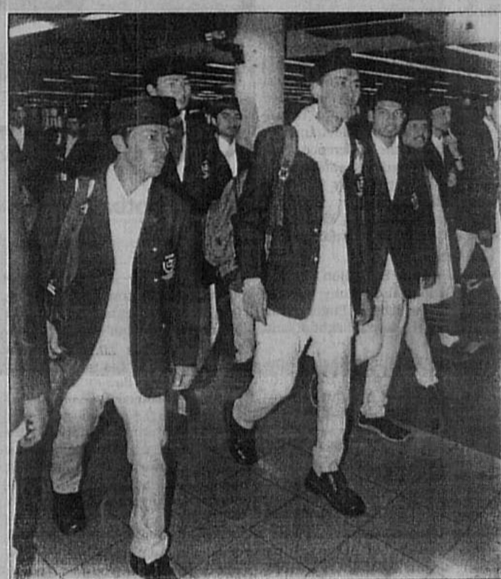
WELCOME TO BANGLADESH: The Nepalese Under-19 cricket team upon their arrival at the Zia International Airport yesterday. Players from the Himalayan kingdom became the first to come here to take part in the ICC U-19 World Cup that starts on February 10. However, the tournament proper begins on February 15.