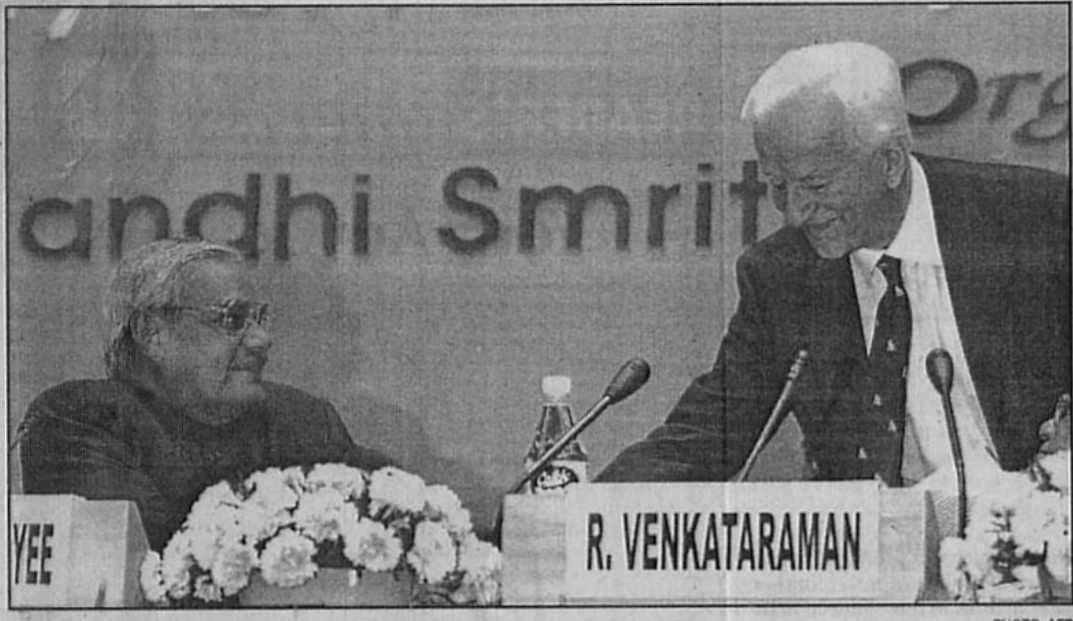
Indian Prime Minister Atal Behari Vajpayee (L) greets former President of Germany Richard Weizsaecker (R) during the inaugural session of the Global Convention on Peace and Non-Violence in New Delhi yesterday. Large number of delegates from India and abroad participated in the convention which ends today.