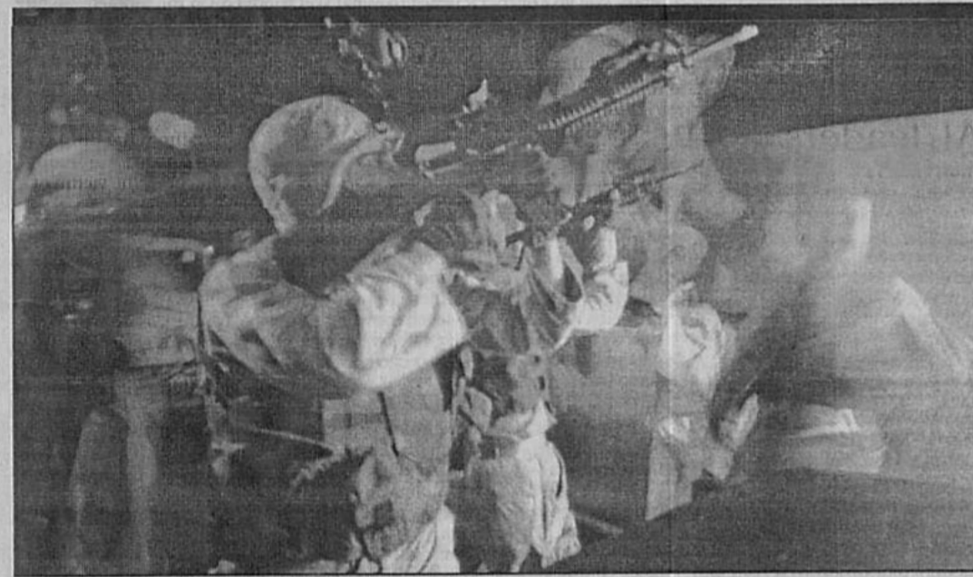
A US soldier from the 1st Battalion, 22nd Infantry Regiment of the 4th Infantry Division, points his weapon during a raid in Tikrit, some 180 km north of Baghdad early yesterday. Iraq was bracing for more violence on the eve of a major Muslim holiday after the Dutch embassy in Baghdad was left in flames by a late night grenade attack and three Iraqi soldiers were killed in the north.

A US-led war toppled the Taliban from power in Afghanistan months several months after the September 11 attacks on the United States, which were blamed on al-Qaeda.