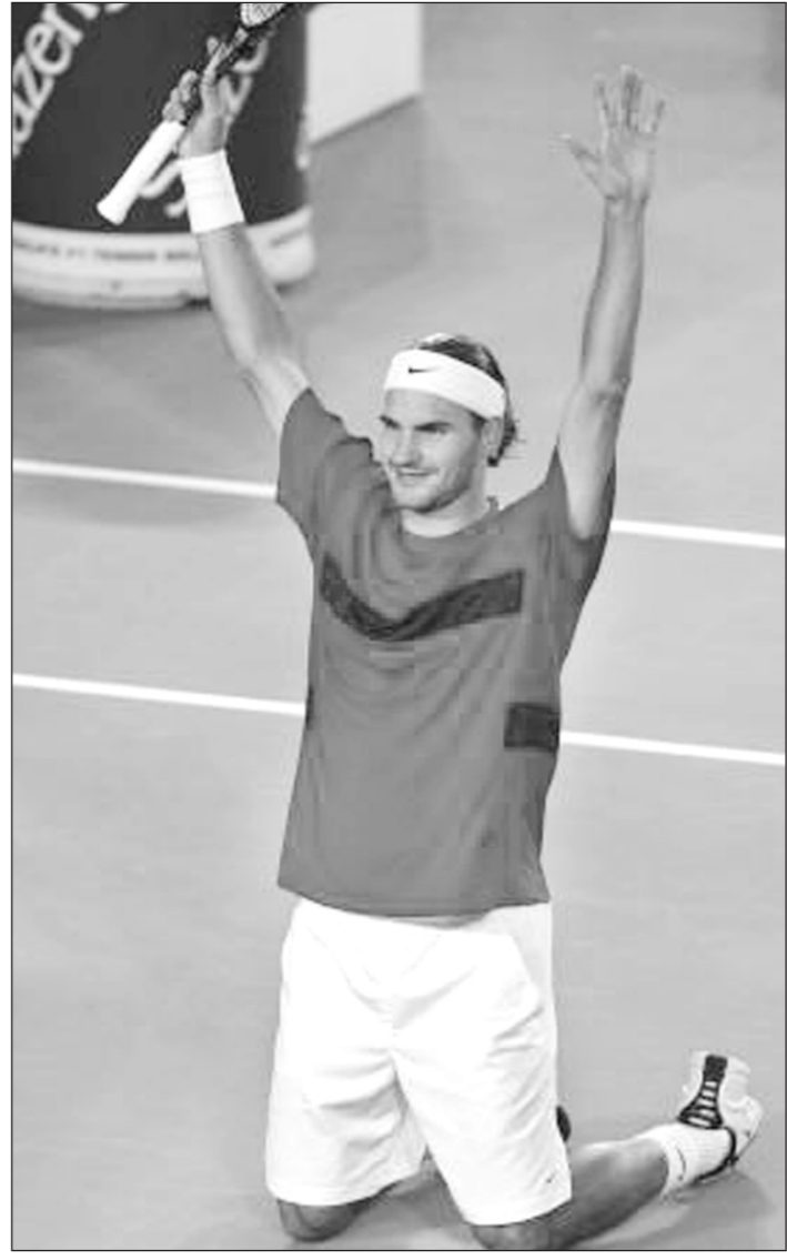
Roger Federer of Switzerland rejoices after defeating Spain's Juan Carlos Ferrero to reach the men's singles final of the Australian Open yesterday.