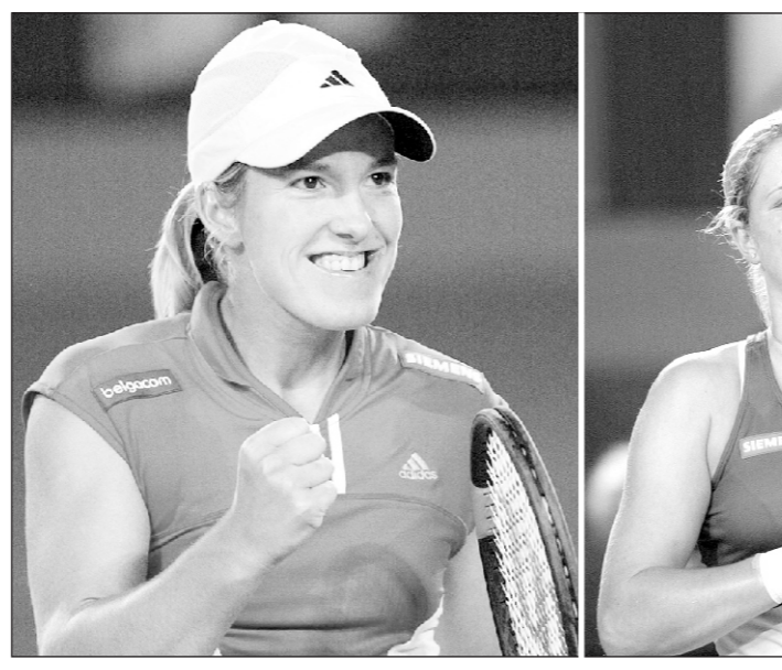
JUSTINE HENIN-HARDENNE KIM CLIJSTERS

Henin-Hardenne was an overwhelming favourite to win the match after starting the new year in great form. She won the Sydney International in the lead-up to the Open and had dropped just 27 games on her way to the semis. SEE PAGE 14 COL 5