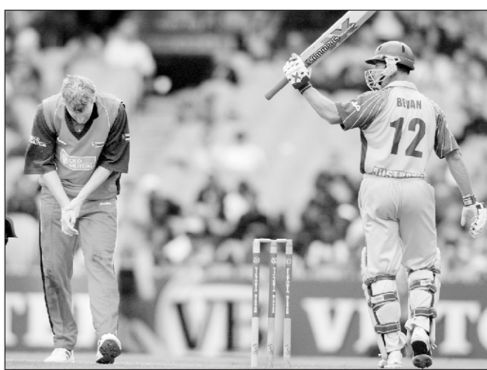
Michael Bevan raises his bat on reaching the half-century against Zimbabwe at Melbourne yesterday.