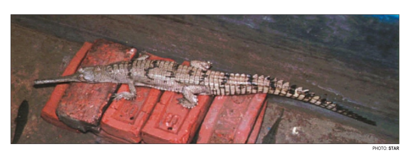
A 102cm-long Gharial, a crocodilian species, believed to be less than a year old, was captured on January 1 in the Padma in Nagarghat.

Political vengeance of the coalition government has been pushing the country towards a disastrous and dangerous situation, she noted. "Moreover, politicisation and nepotism by the ruling alliance have created a suffocating atmosphere where the government officials, who are not loval to the ruling parties, are SEE PAGE 11 COL 6