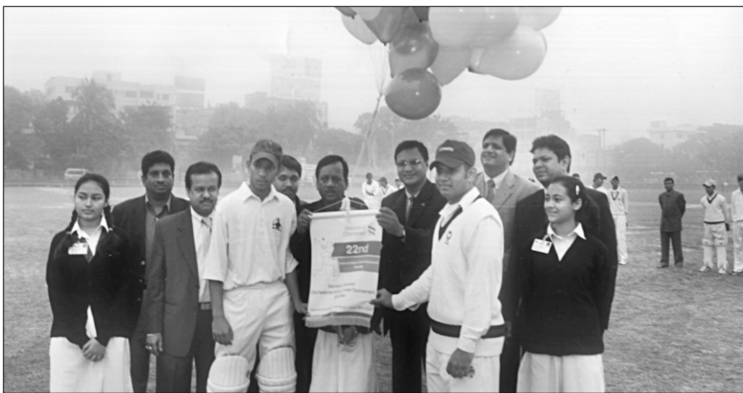
State Minister for Youth and Sports Fazlur Rahman (C) inaugurates the Dhaka Zonal round of the Standard Chartered 22nd National Schools Cricket Competition at the Dhanmondi Club ground yesterday.