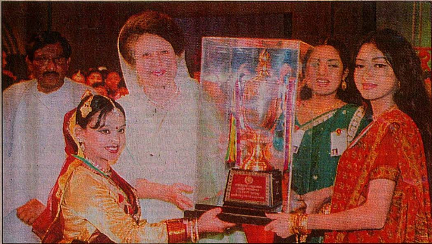
Prime Minister Khaleda Zia gives away prizes to the winners of Natun Kuri competitions at the Bangladesh Television centre in the city yesterday.