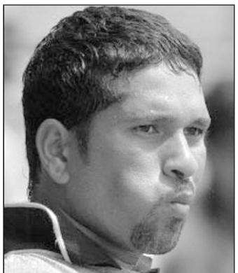
Sachin Tendulkar (India's star batsman) "Records will come when one plays for such a long time. But it is nice to be counted among the best."