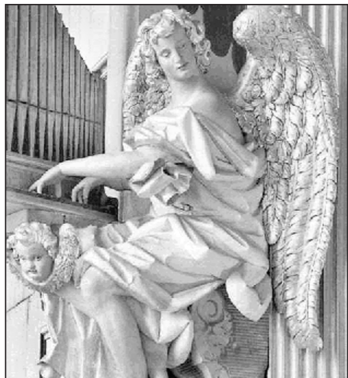
Baroque angelic organist adorning the Gottfried Silbermann organ completed in 1714 for the Cathedral in Saxony, Germany

Another development of the baroque era was the string chamber opera that flourished during the time of the great violin maker, Stradivari. Violin playing became an art and the string orchestras of the Italian baroque reached a great height in the early 1700s. The two great figures of the late baroque were Johan Sebastian Bach (1685-1750) and George Frederic Handel (1685-1759).