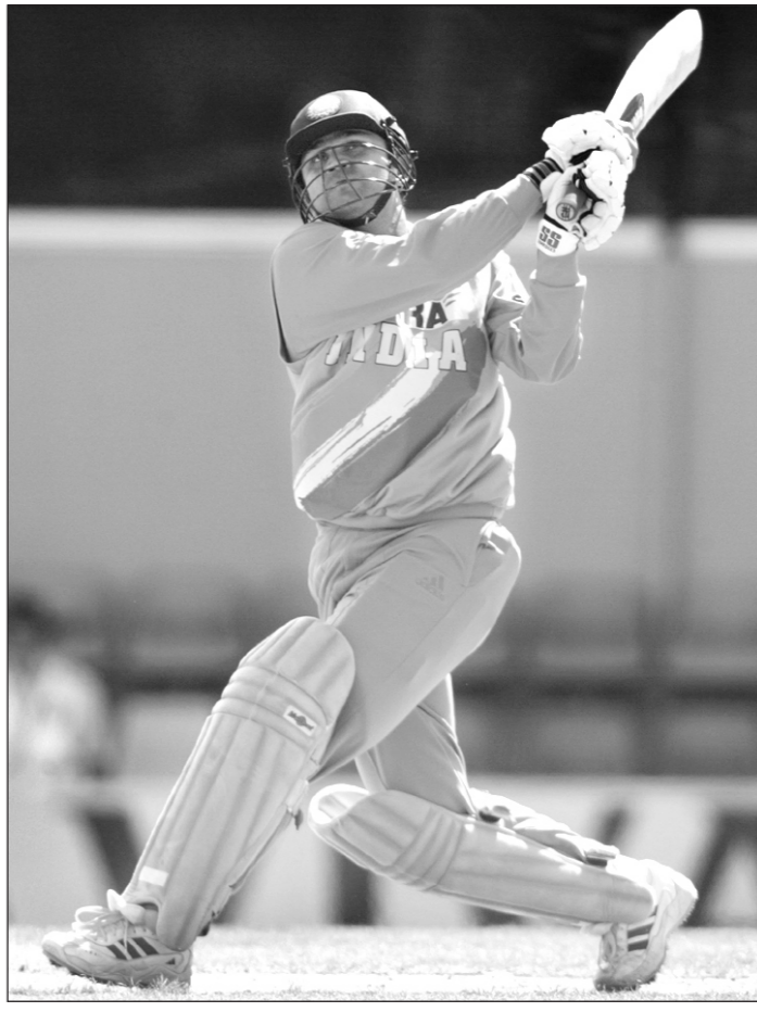
MAN-OF-THE-MATCH: Indian opener Virender Sehwag lofts one for maximum on way to scoring a 99-ball 90 against Zimbabwe in their VB tri-series encounter at Hobart yesterday.

AFP, Hobart A blistering 90 from man-of-the-match Virender Sehwag helped India to a seven-wicket win over Zimbabwe and their first victory of the tri-nation series at Bellerive Oval here on Wednesday. Sehwag, a part-time spinner who had earlier taken 2-40 against Zimbabwe's batsmen, blasted his runs off just 99 deliveries in an innings which included nine boundaries five of them sixes. India finished with 211 for three, for its first victory in the series after both teams lost their opening matches against host-nation Australia. Chasing Zimbabwe's 208 for six, Sehwag joined with the little master Sachin Tendulkar, who made 44, to put India in control with an opening stand of 130 from 24 overs. From there only a miracle could save Zimbabwe and despite picking up 42 for three, India bolted to victory with 74 balls to spare well inside the 40 overs needed to earn a bonus point for the match. Captain Sourav Ganguly hit a breezy 32 not out, with V.V.S Laxman unbeaten on 13. Tendulkar smashed four early boundaries and at one stage led his partner by 15 runs before Sehwag hit full throttle. Earlier a late flourish by Zimbabwe captain Heath Streak had helped carry his team to a respectable 208 for six after the top order again failed to find form. Streak paired with all-rounder Sean Ervine for a 93-run partnership from just 72 balls to help rescue Zimbabwe's innings after an uninspiring performance by the top-order.