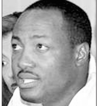
BRIAN LARA Hayden (58.28), Ricky Ponting (55.97) and Adam Gilchrist (55.59). India fielded Rahul Dravid (57.42), in 11th place one spot ahead of Sachin Tendulkar (57.19).

REUTERS, London Throughout the ages bowlers have seen themselves as downtrodden artisans compared to batsmen. "The last bowler to be knighted," remarked wit, writer and leg-spin bowler Arthur Mailey, "was Sir Francis Drake." Mailey, a gifted if often profligate leg-spin and googly bowler for Australia during the 1920s, would have winced in sympathy as 1,747 runs were accumulated in the recent fourth Test between Australia and India. Five batsmen in the all-time top 20 by average were present in Sydney for Steve Waugh's final Test. They included Australia's Matthew