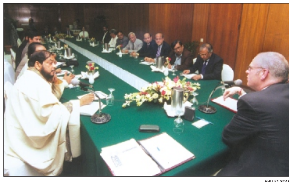
Visiting US Congressman Joseph Crowley exchanges views with media editors at Sonargaon Hotel