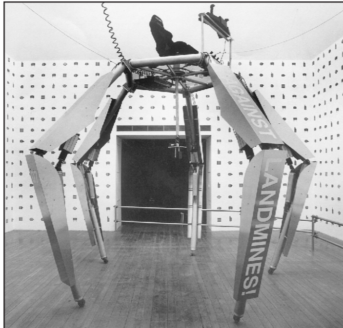
'Penta' alludes possibilities of peace and will captivate many

In Domoto Yuumi's double-faced picture of the tulip, we see a flower whose petals are very heavy. The petals hang in a tenuous balance, symbolizing love and sorrow. Domoto shows us the importance of accepting events quietly and calmly. She shows for