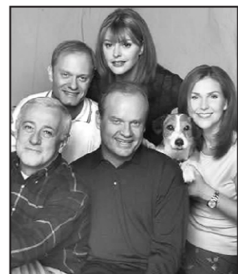
Frasier days are over

Official word that "Frasier's" days are numbered comes as NBC prepares to bid farewell in May to