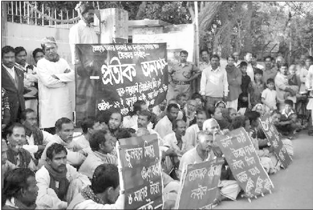
Ninety-eight workers of state-owned Darwani Textile Mills on a token hunger strike in front of the mill gate in Nilphamari on Monday.