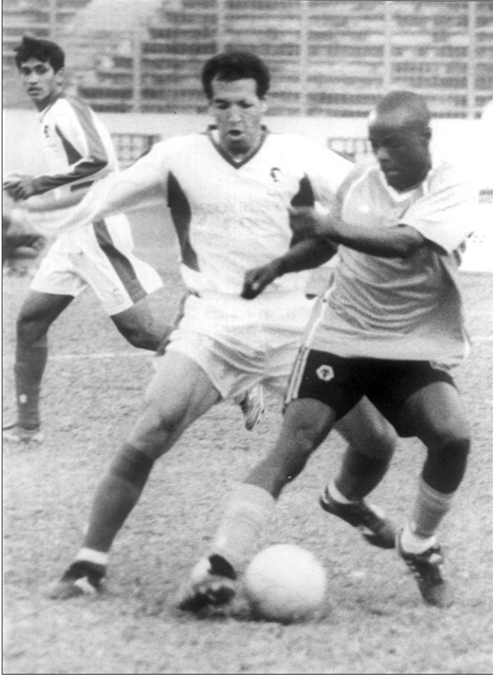
Action on yesterday's Western Union Premier Division Football League clash between Brothers Union and Sheikh Russell Krira Chakra at the Sher-e-Bangla National Stadium in Mirpur.