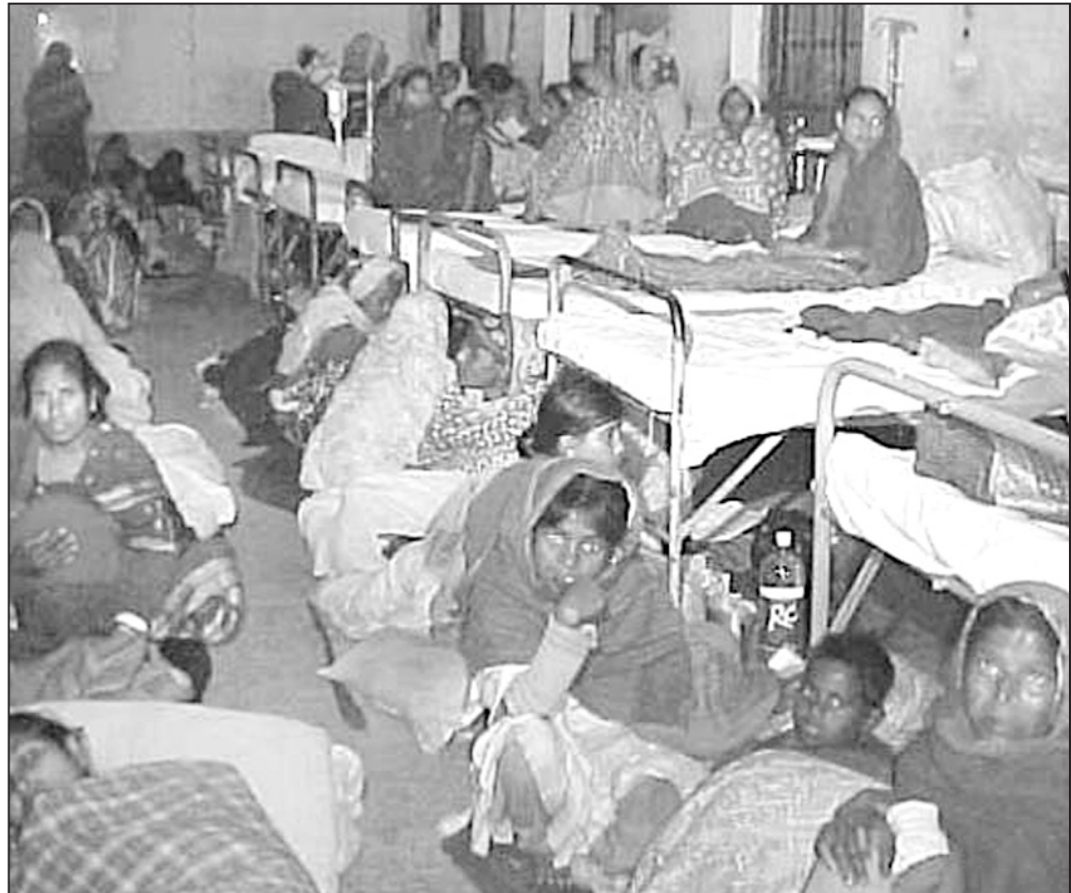
Even the floor at Children's Ward at Bogra Mohammad Ali Hospital is packed with pneumonia patients. The photo was taken yesterday.

Contacted over telephone, the BDR command at Lalmonirhat denied the allegation.