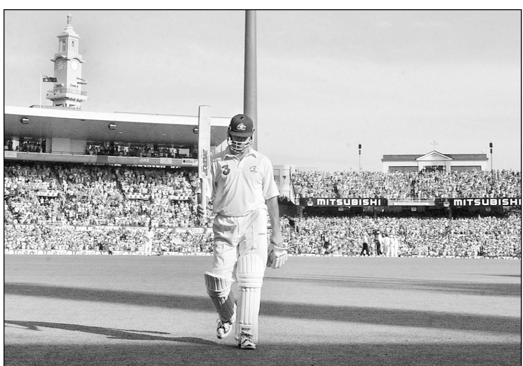
Australia captain Steve Waugh trudging off the field after being dismissed for 40 in his side's first innings on the third day of the fourth and final Test against India in Sydney yesterday.

The 27-year-old is considered a utility player as he also bowls left-arm spin in first-class and domestic one-day matches. The tournament gets under way at Melbourne on January 9.