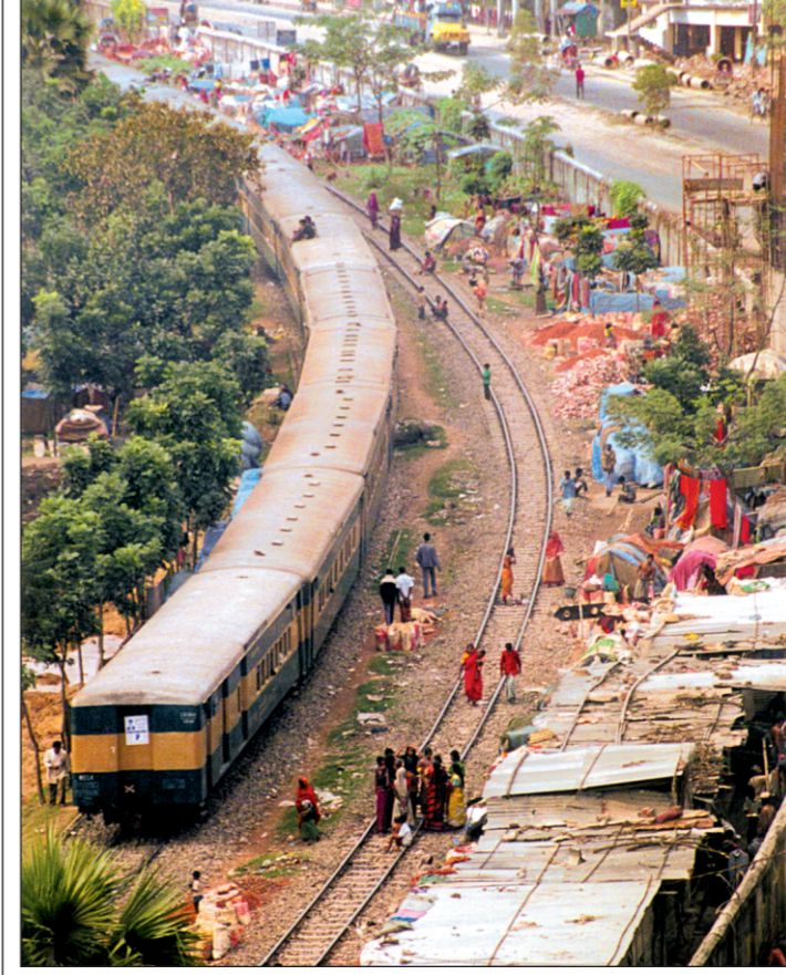
A row of shanties lines the rail tracks north of Khilgaon rail crossing, undermining Bangladesh Railway's directive that this narrow strip of land is off-limits to public use.

Police seized the bus but the driver escaped arrest. A case was filed with Kotwali Police Station.