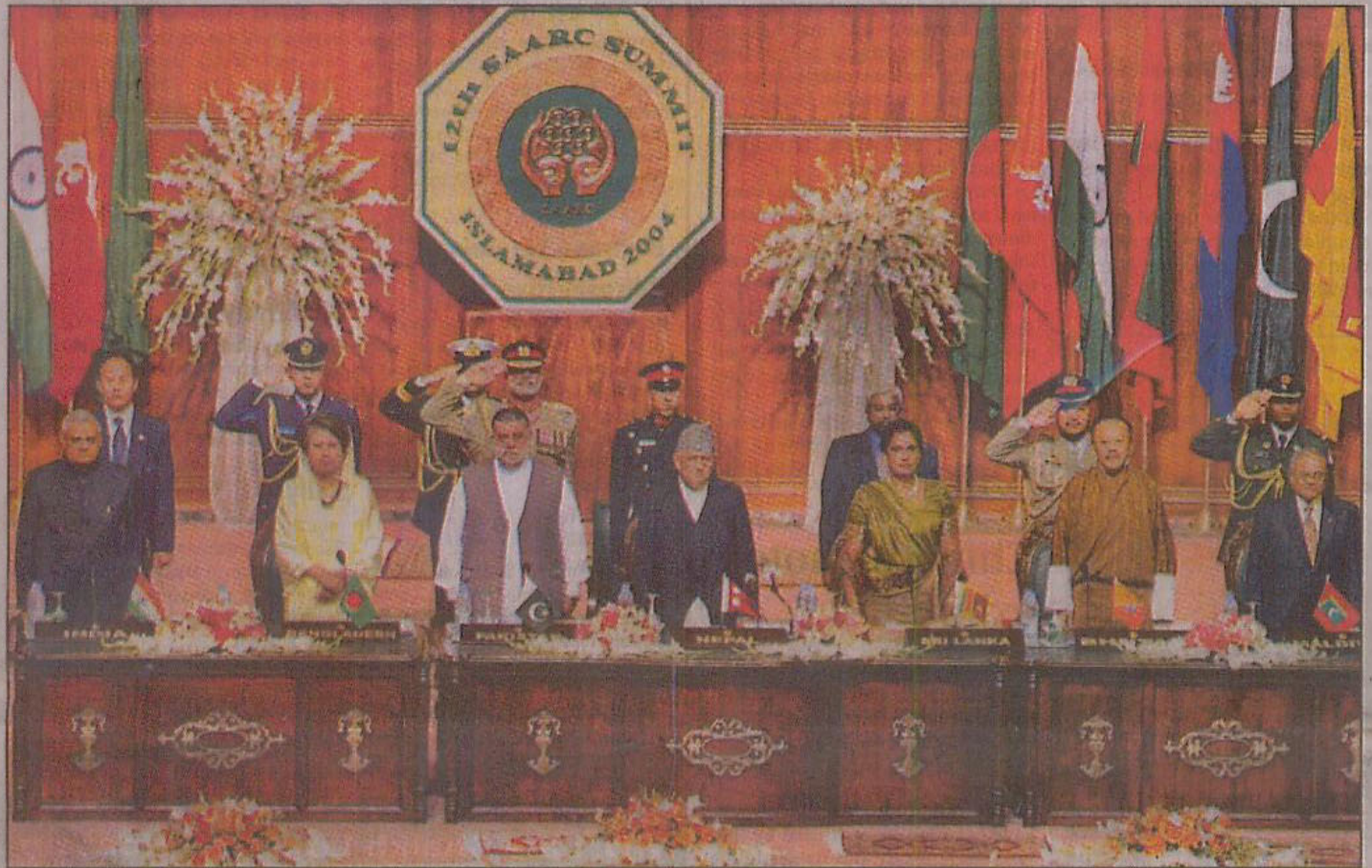
The seven South Asian heads of state and government, from left to right, Indian Prime Minister Atal Behari Vajpayee, Bangladeshi Prime Minister Khaleda Zia, Pakistani Prime Minister Mir Zafarullah Khan Jamali, Nepalese Prime Minister Surya Bahadur Thapa, Sri Lankan President Chandrika Kumaratunga, Bhutanese Prime Minister Jigmi Thinley and Maldivian President Maumoon Abdul Gayoom at the opening of the 12th Saarc Summit in Islamabad yesterday.