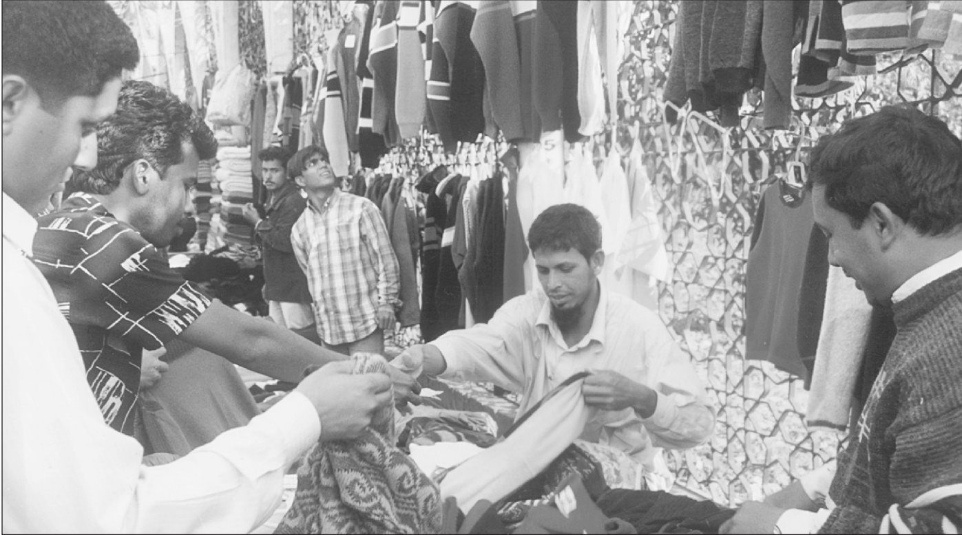
Warm clothes on sale at the Baitul Mukarram

"Less import of used clothes can also save some foreign currency as well," he added.