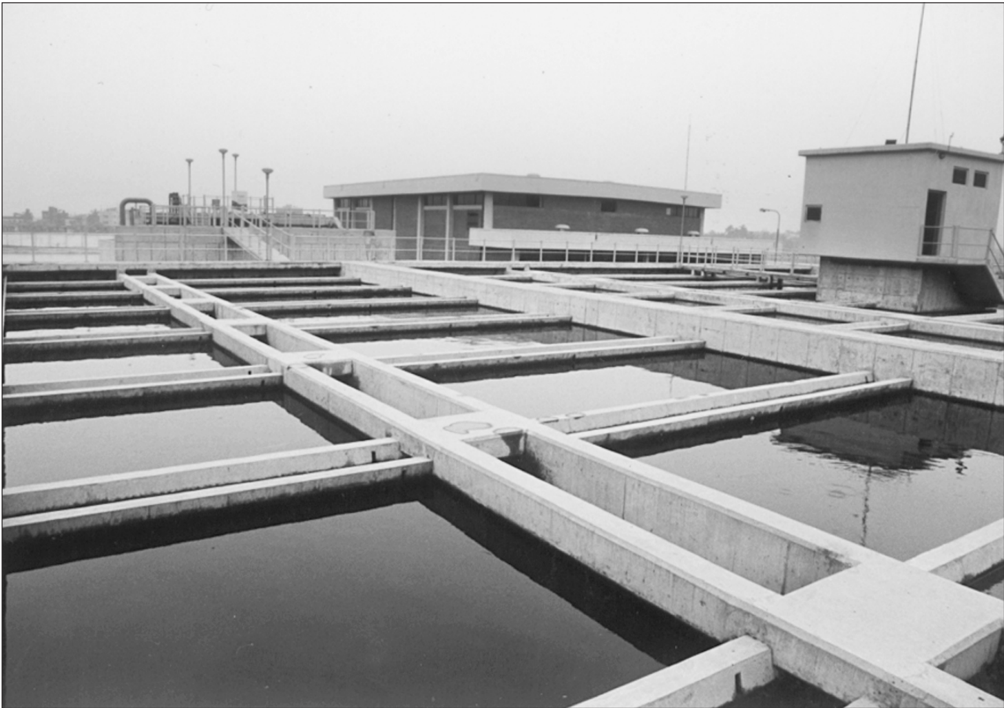
The water treatment plant at Sayedabad. The Pagla plant will be very big if it comes into being.