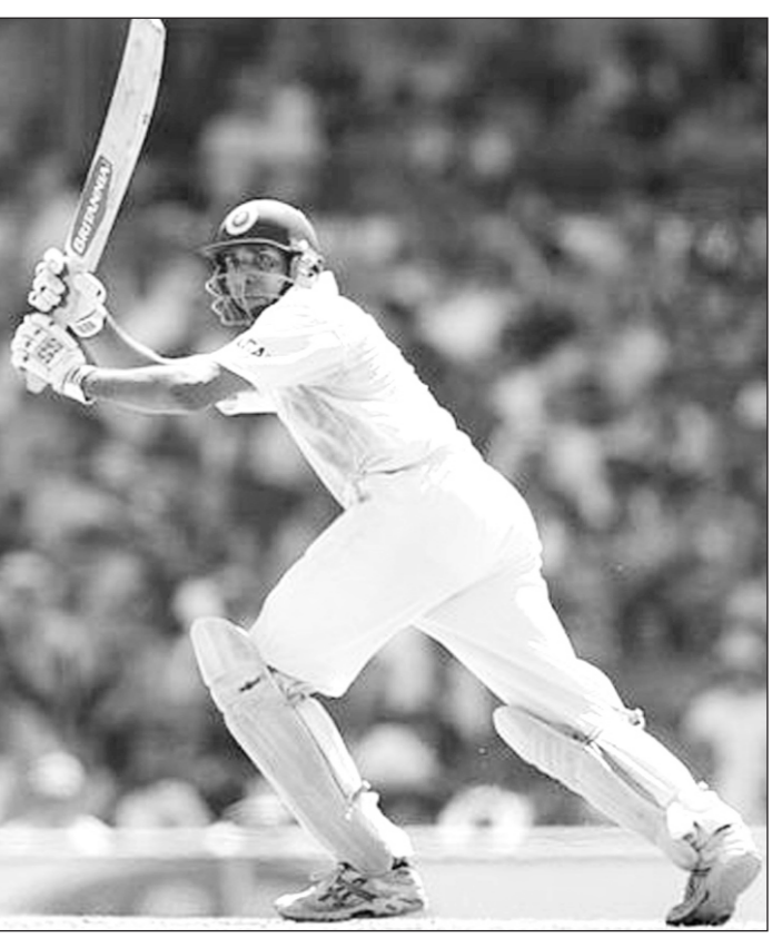
VVS Laxman of India follows through on a flick during his knock of 178 against Australia yesterday.