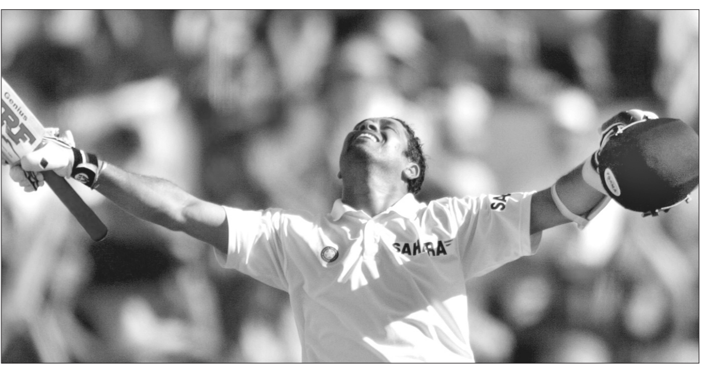
GOD MUST BE AN INDIAN: Master Indian batsman Sachin Tendulkar celebrates his double-century on the second day of the fourth and final Test against Australia in Sydney yesterday.

Scott Styris gave the home side the victory. "I thought we had it in the middle of their innings but Styris batted magnificently. He was a real hero for New Zealand," said Miandad. Pakistan had won 11 of their previous 13 one-day meetings with New Zealand, including all five on home soil last month. But Styris rose to the occasion with his second century in a limited-overs international, having made 141 against Sri Lanka at last year's World Cup. Styris' temperament under SEE PAGE 14 COL 1