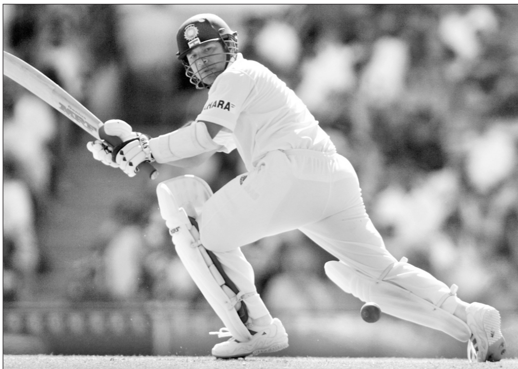
Indian master batsman Sachin Tendulkar flicks during his unbeaten 73 against Australia in the fourth and deciding Test at the SCG yesterday.

Sehwag, who exhilarated with his adventurous knock of 195 in