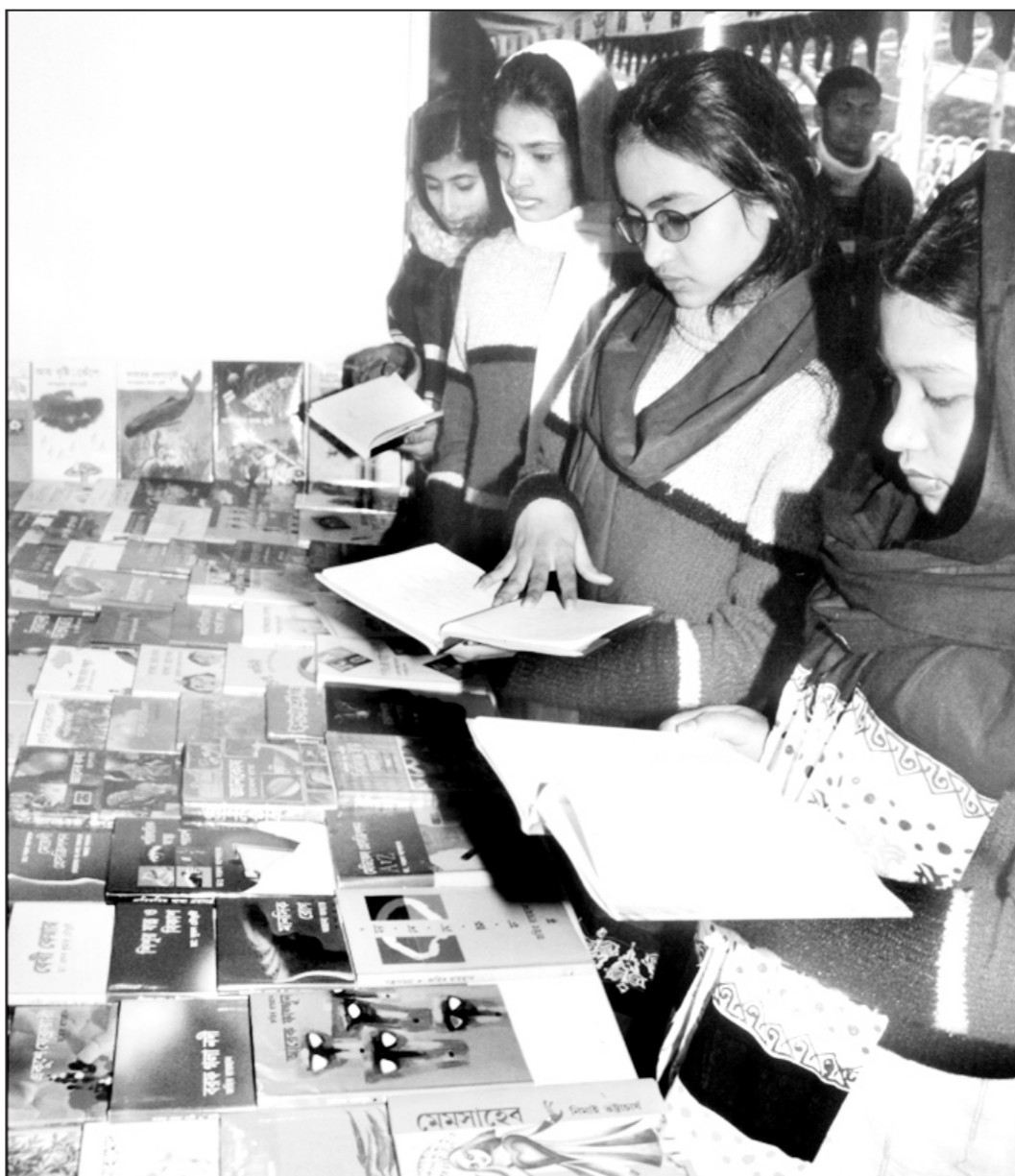
Visitors leaf through books at Dhaka Book Fair which began at the Bangladesh-China Friendship Conference Centre in the city on January 1.