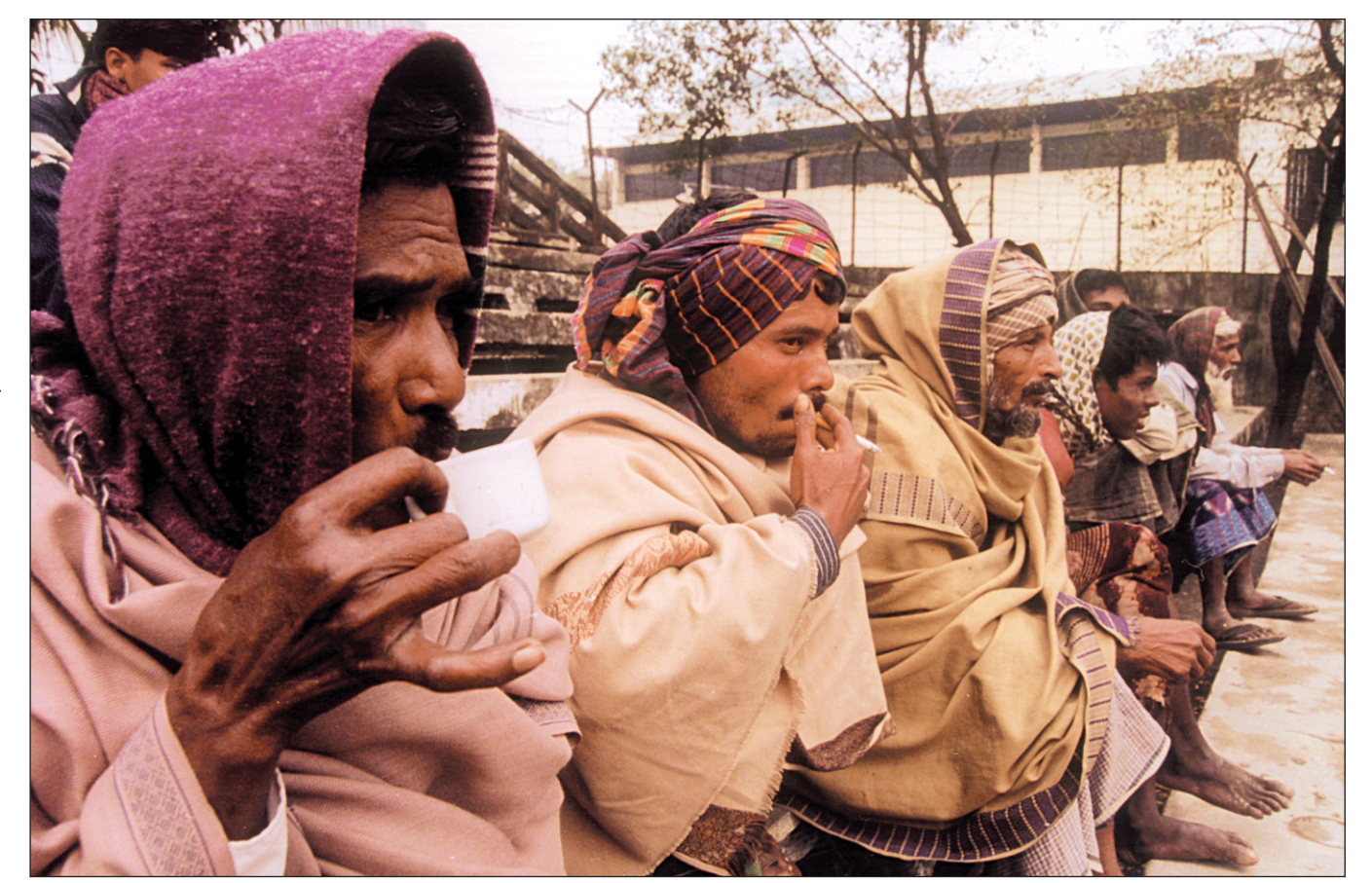
Workers waiting for work near Bangabandhu National Stadium keep warm with tea and cigarettes in efforts to beat the cold snap that has swept the capital with chill winds and fog.