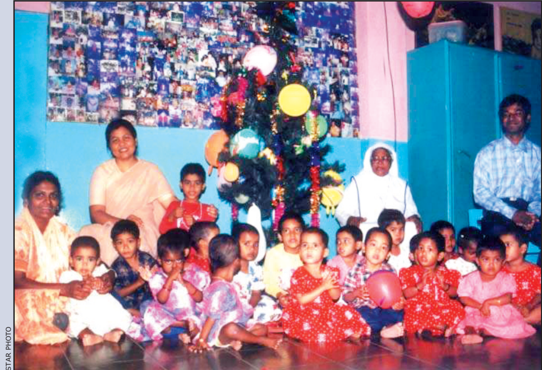
Children of Saint Benedict's Orphanage of Patharghata celebrate the Christmas. They were in new attires and found joys all around them.

Over 1800 children vied in the admission test for 100 seats in KG 1 of Ispahani Public School and College this year. Like every year the school authorities were under a tremendous pressure when admission seekers along with their guardians arrived at the school compound (left) on December 27. The situation went beyond the control when some unruly guardians broke the bamboo-made fence of the school. As the children were stranded inside the school, some