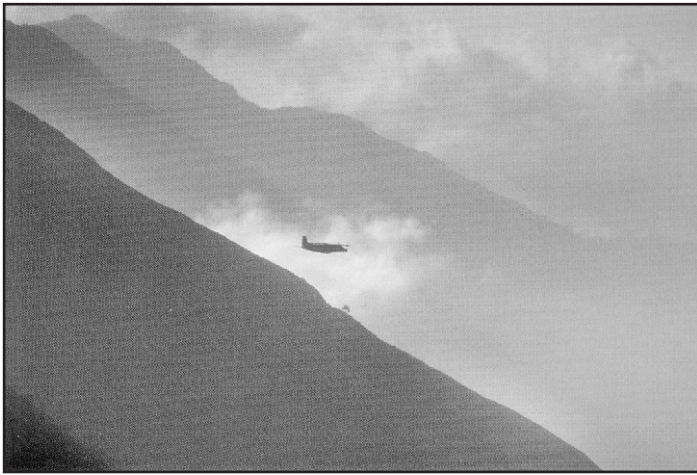
The power and beauty of flight!

Their photographs displayed different aircraft flying at par with the nature, with mountains and clouds drifting in the background. There were also pictures of people strolling by and suddenly stopping to watch a moving aircraft above them, as if making a path for the conqueror of the sky. Scenes like, children throwing off their play things and moving their heads backwards to see a flying aircraft shading their