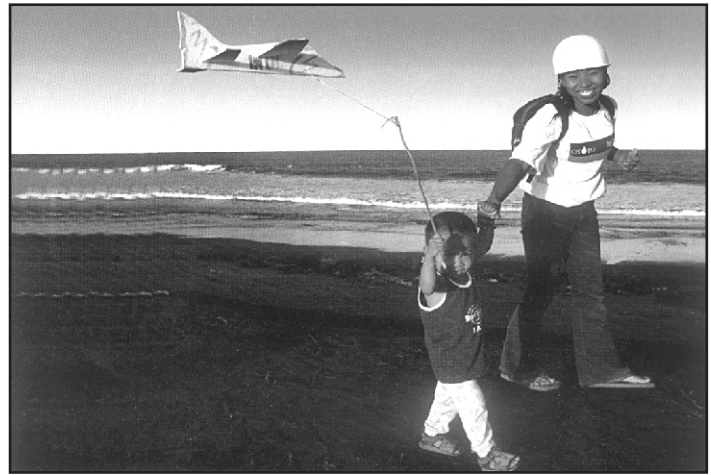
Playing with the aircraft might become true in this baby's life.

Someone once said that the world is a small place. Whoever he was, he probably never realised the extent of this truth. Today a mere mortal can fly like a bird, without any wings and close the gaps between the thousands of boundaries in the world.