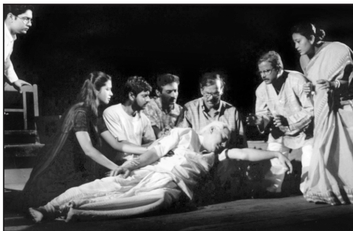
Dandik, the group from Kolkata, will stage Bhalo Chhele as part of the drama festival arranged by Nagorik Natyangan at 7:00 p.m. at the Public Library Auditorium today.