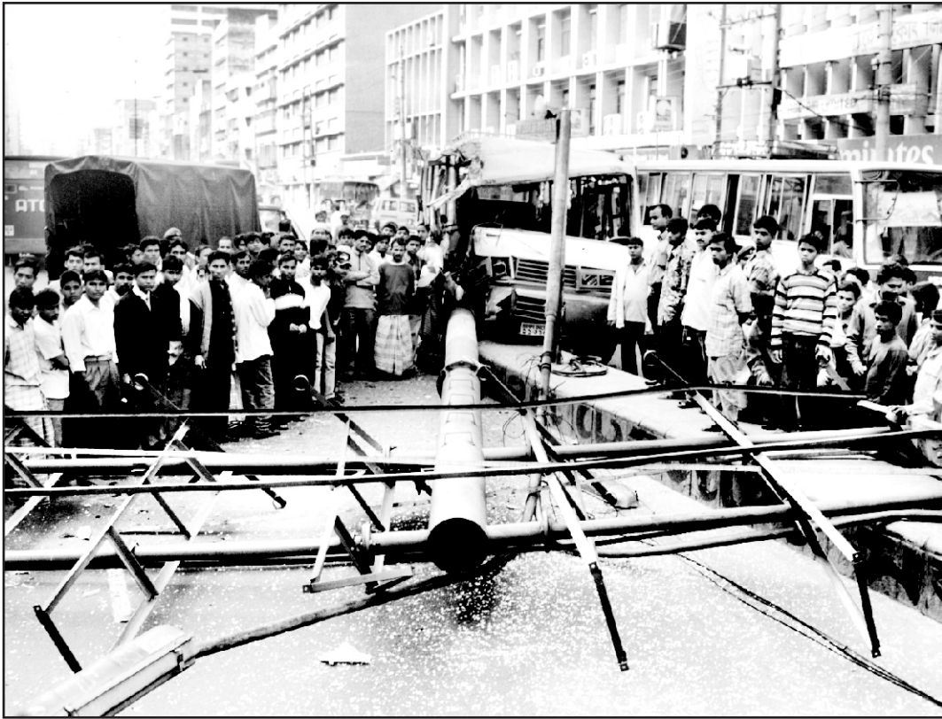
An electric pole on the road divider fell to the ground after being hit by a bus whose driver lost control of the steering at Motijheel in the city yesterday.