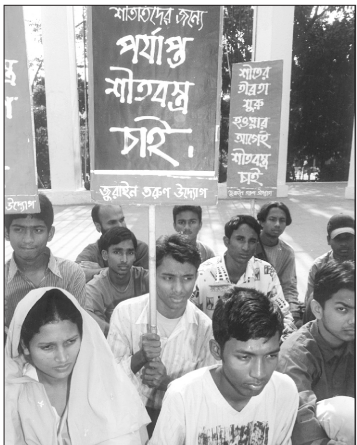
The Jurain Tarun Udyog stages a demonstration at the Central Shaheed Minar in the city yesterday demanding steps to distribute warm clothes among the poor across the country.