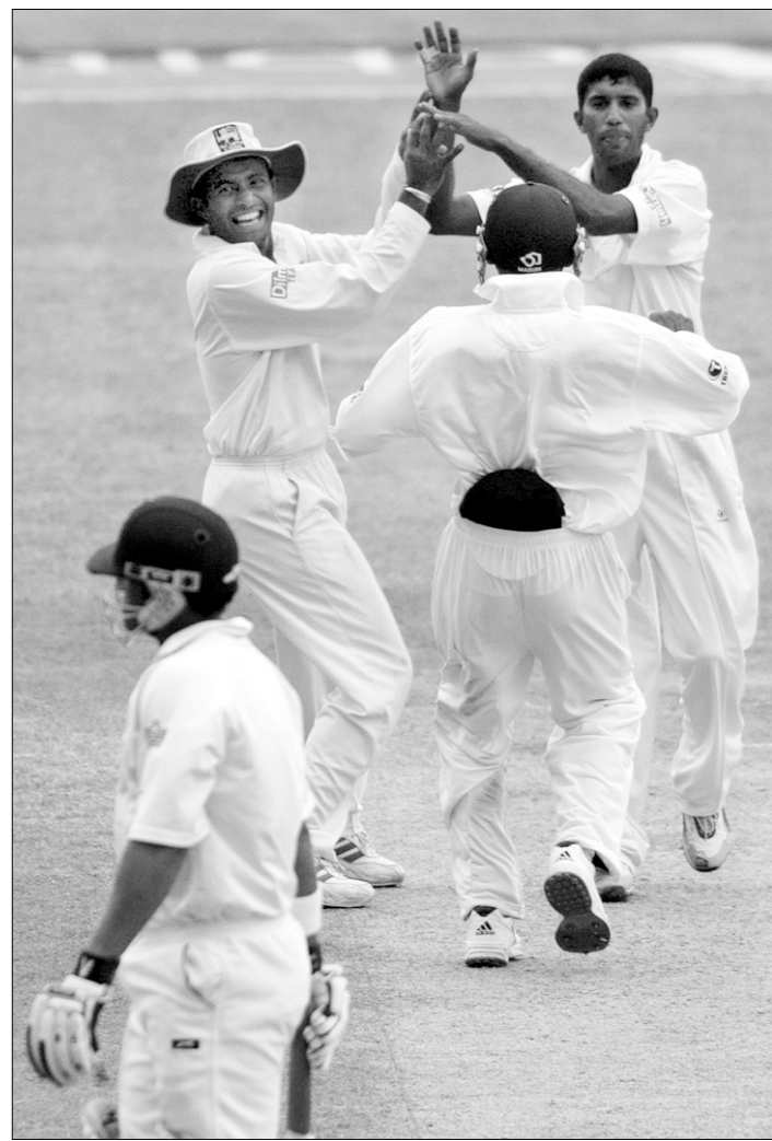
Sri Lankan players celebrate the dismissal of Mark Butcher on the second day of the second Test against England at Kandy yesterday.