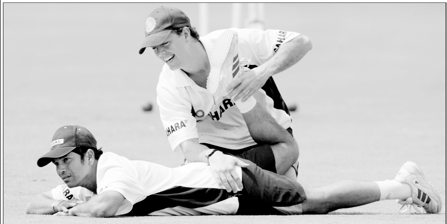
NO LOOKING BACK: India superstar Sachin Tendulkar stretches with the help of physio Andrew Leipus during a practice session at Adelaide yesterday.