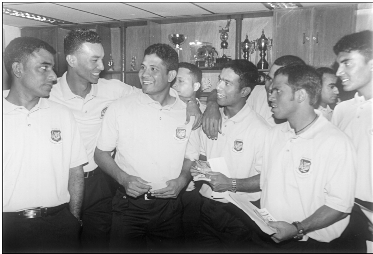
The Pakistan-bound Bangladesh A cricket team members share a lively moment at the BCB office at Bangabandhu National Stadium prior to their departure yesterday.