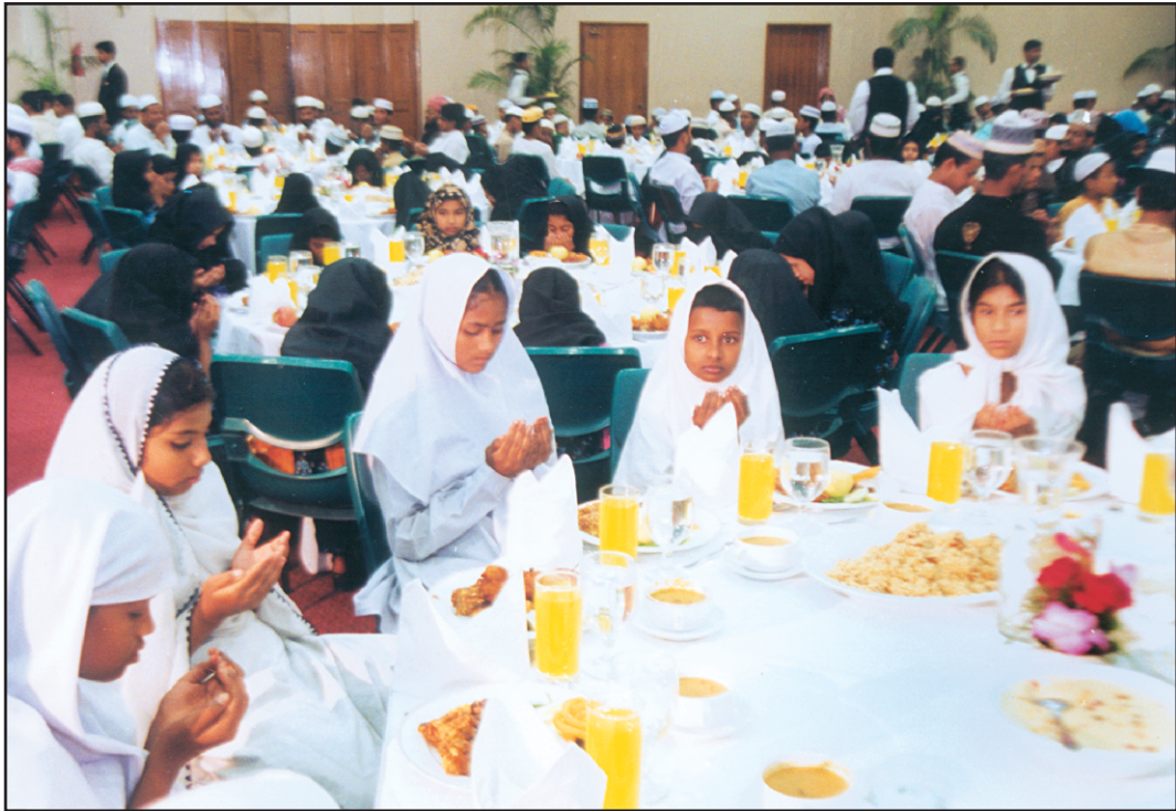
PHOTO: STAR Sheraton Hotel hosts an iftar party for orphans and students of five madrassahs at its winter garden in the city yesterday.