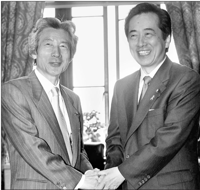
Japanese Prime Minister Junichiro Koizumi (L) shakes hands with opposition Democratic Party of Japan leader Naoto Kan at the National Diet after Koizumi was re-elected as prime minister yesterday.

how to manage the 400,000 dollars a month allocated to the Nasiriyah region. But I can show him that from last May until now we spent more than 20 million dollars in this area alone." "He says we need the UN here? Well, we want them here too. But it was they who left Iraq, refusing our protection," added Bremer, a former US ambassador to the Netherlands who has headed the council since May. "Two weeks ago in Madrid I met Kofi Annan and tried to convince him to return. Even if, I have to tell you, the UN is certainly not a model of efficiency, thrift and dynamism."