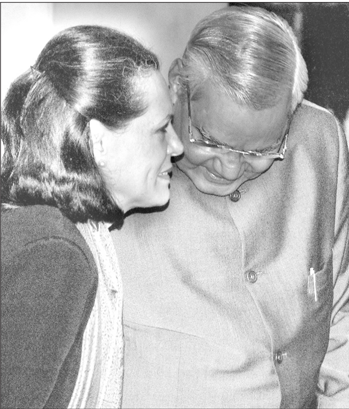
Indian opposition leader and President of Congress Party Sonia Gandhi (L) talks with Indian Prime Minister Atal Behari Vajpayee as they meet at the presentation of the India Gandhi Prize for Peace, Disarmament and Development 2002 at The Presidential Palace in New Delhi yesterday.